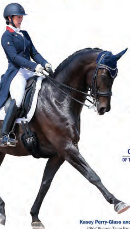
Kasey Perry-Glass and Dublet 2016 Olympic Team Bronze Medal U.S. Dressage Team