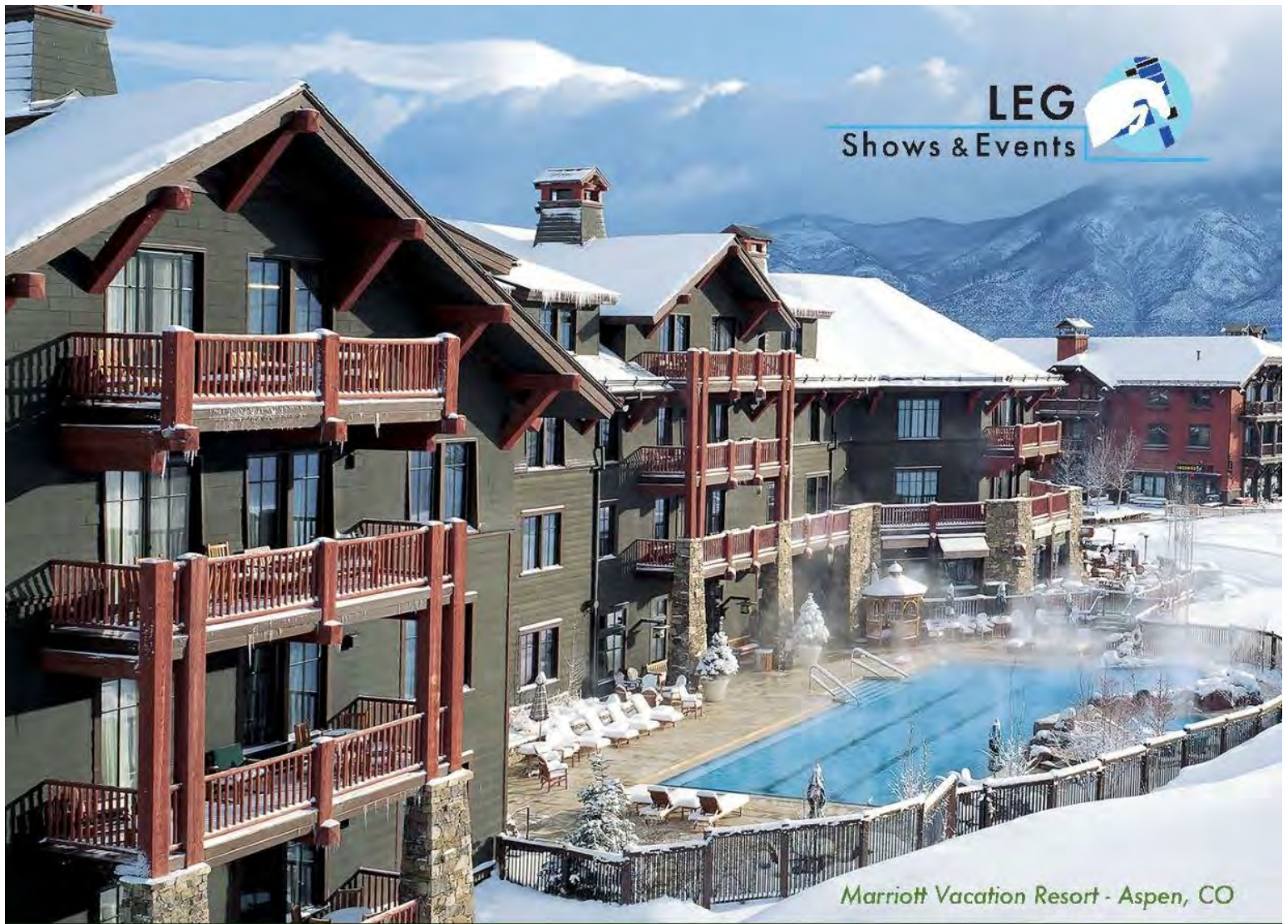
Marriott Vacation Resort - Aspen, CO