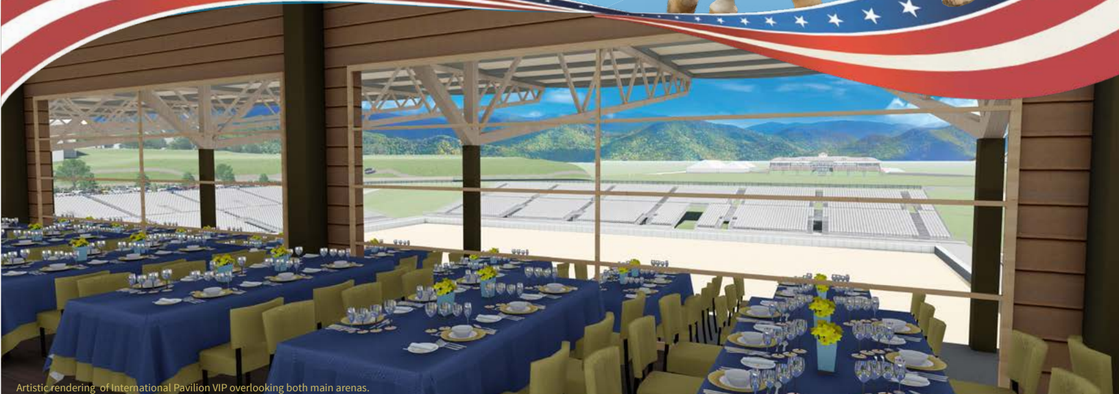
Artistic rendering of International Pavilion VIP overlooking both main arenas.

Enjoy America's largest sporting event in 2018 with shared hospitality. September 11-23, 2018 TRYON-NC-USA